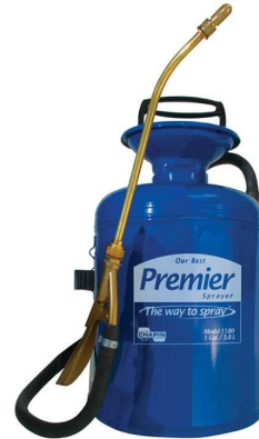
#1180 Adjustable Cone Pattern