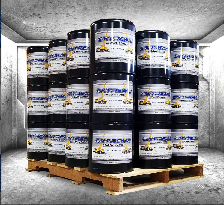
Bulk: 5-gallon Pails