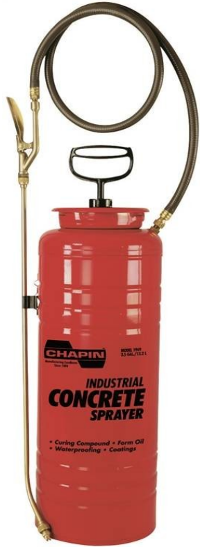
#1949 16" Fan Pattern