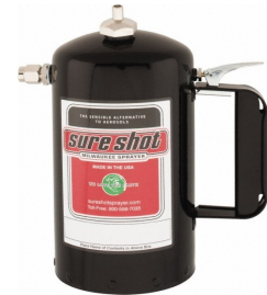
#A1000B Cone Pattern – Non Adj.