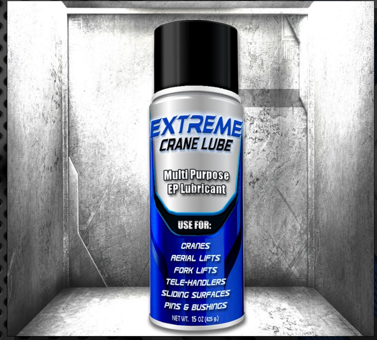
Aerosol Cans: 15oz cans 12 cans per case.