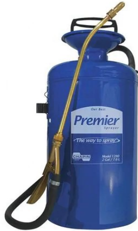
#1280 Adjustable Cone Pattern